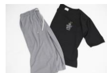
Hotel's original pajamas