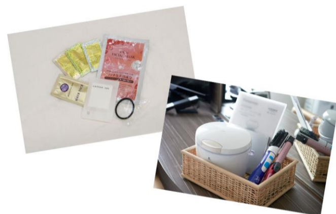
Women's amenity kit