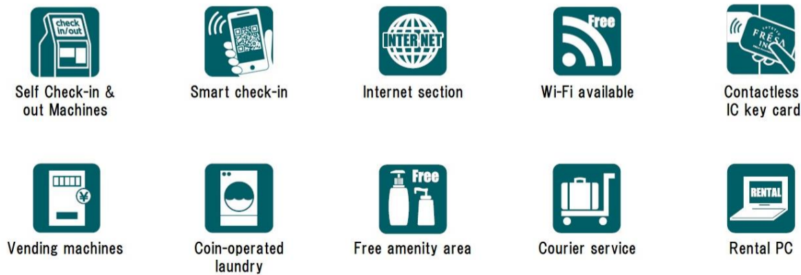
Free amenity area