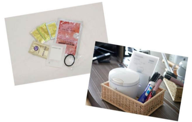
Women's amenity kit