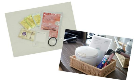
Women's amenity kit