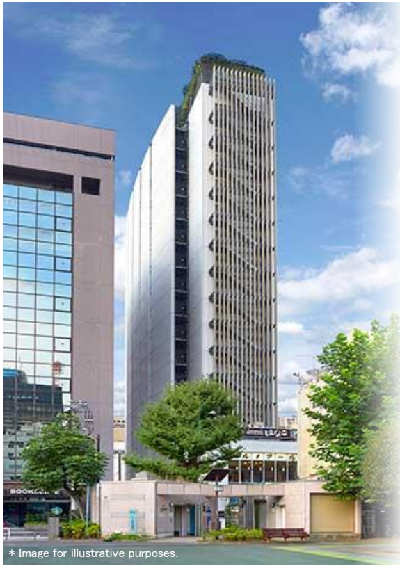
* Image for illustrative purposes.