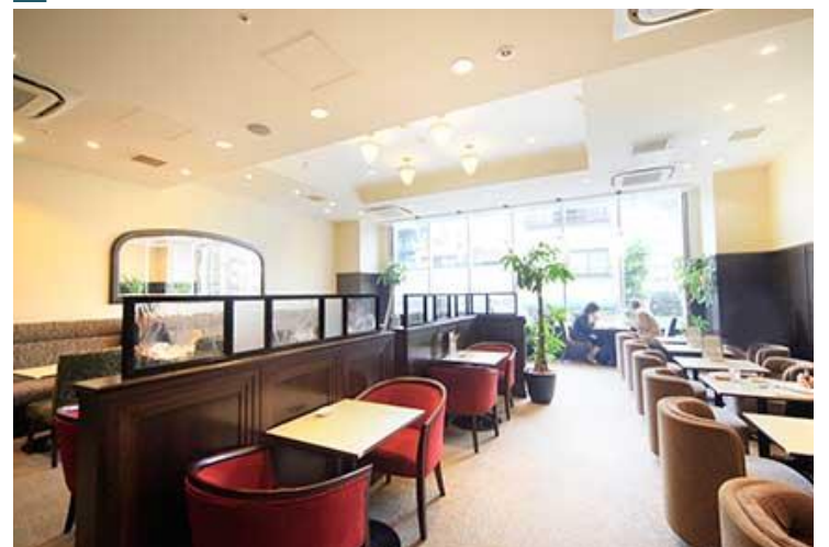
COFFEE ROOM Renoir