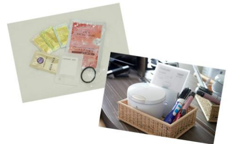
Women's amenity kit