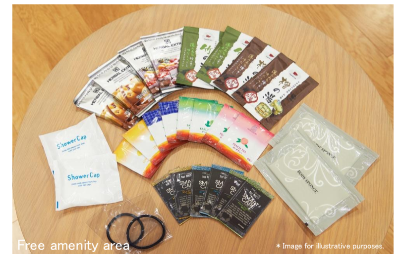
Free amenity area