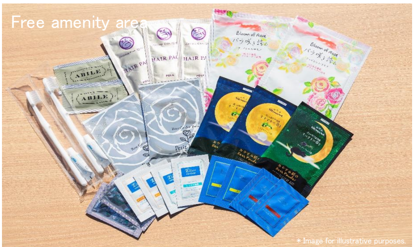
Free amenity area