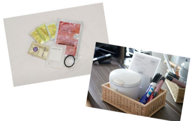
Women's amenity kit