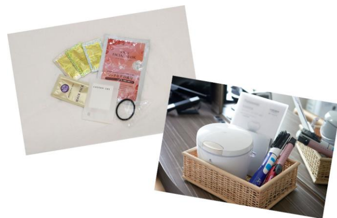
■ Skin care / Hair care amenities