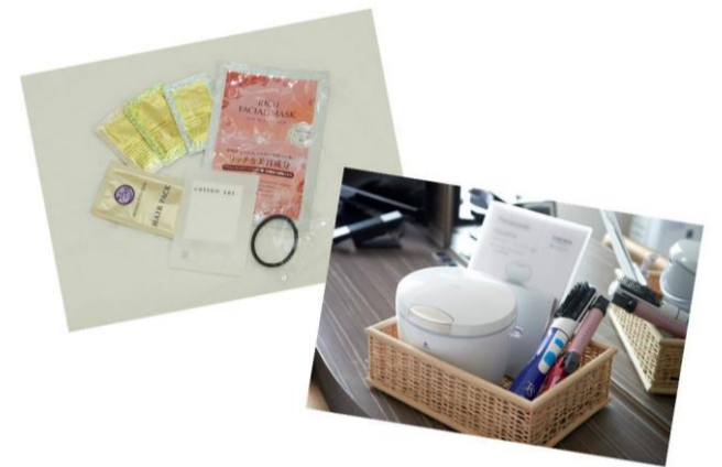
Women's amenity kit