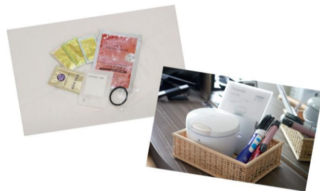
Women's amenity kit