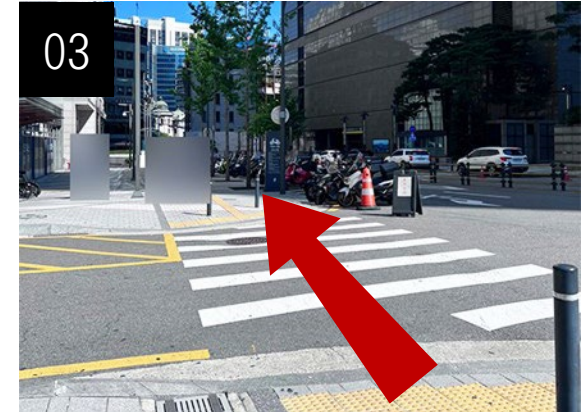
Exit and go straight.