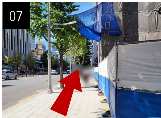
Cross at the crosswalk, turn left, then go straight for about one minute.