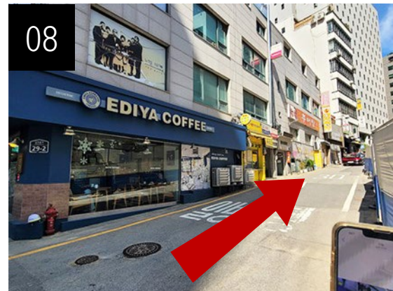
Go down the alley where Ediya Coffee is, and you will find Sotetsu Hotels The Splaisir Seoul Myeongdong.