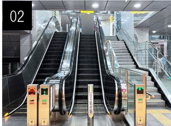
Take the escalators or elevators.