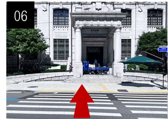
Cross the street at the crosswalk.