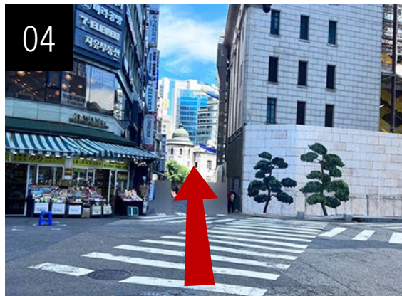
Keep going straight.