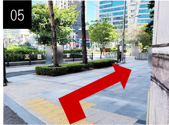
Turn right and head toward the crosswalk.