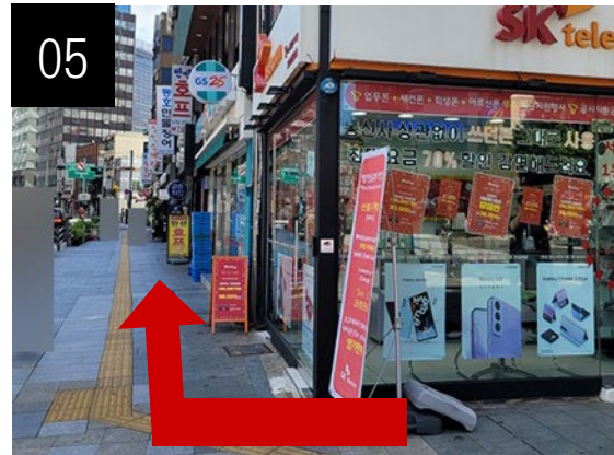
After crossing at the crosswalk, head left along the street.