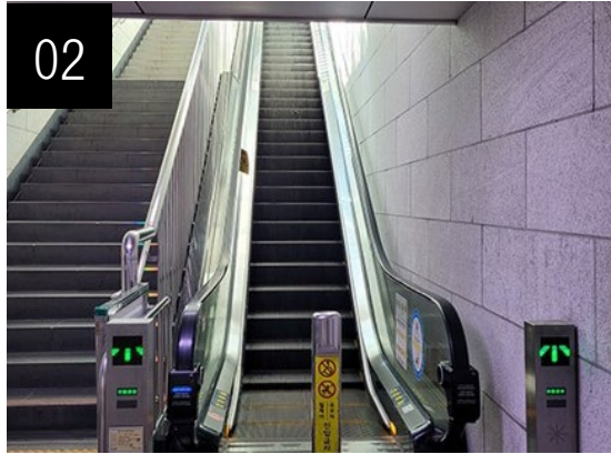
Take the escalators.