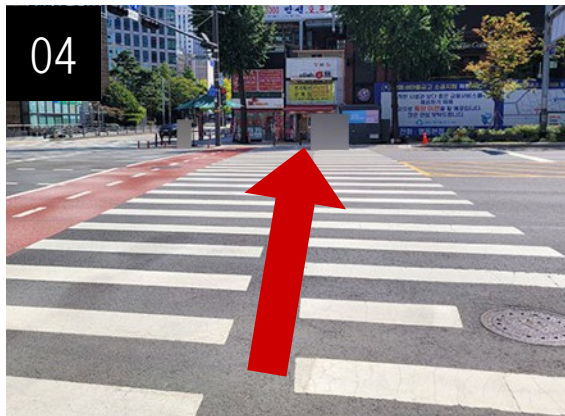
Cross the main street at the crosswalk.