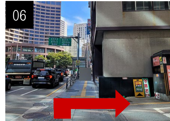
Walk about one minute, then turn right.