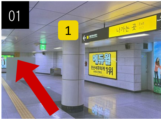
Head toward Exit 1 of City Hall Station.