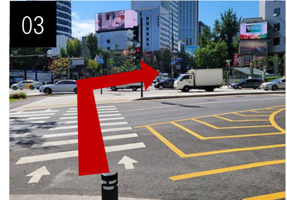
Once you reach the top of the escalators, cross the street at the crosswalk to your left. (Twice in a row)