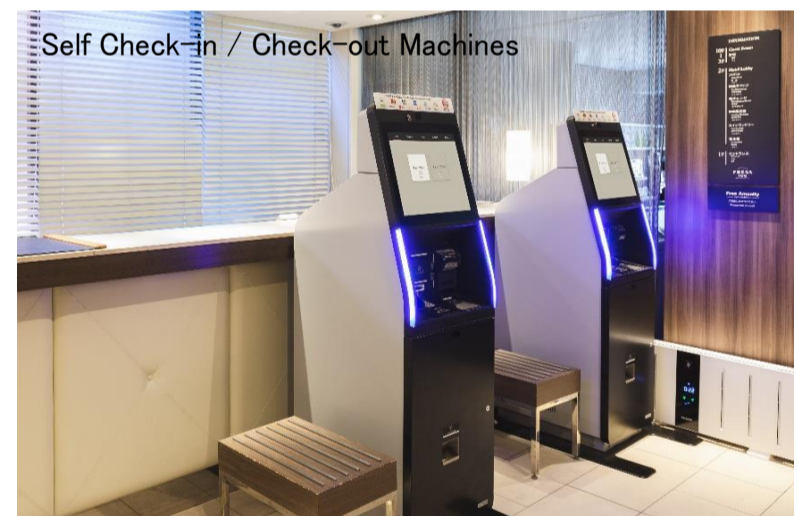
Self Check-in / Check-out Machines