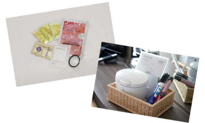
Women's amenity kit