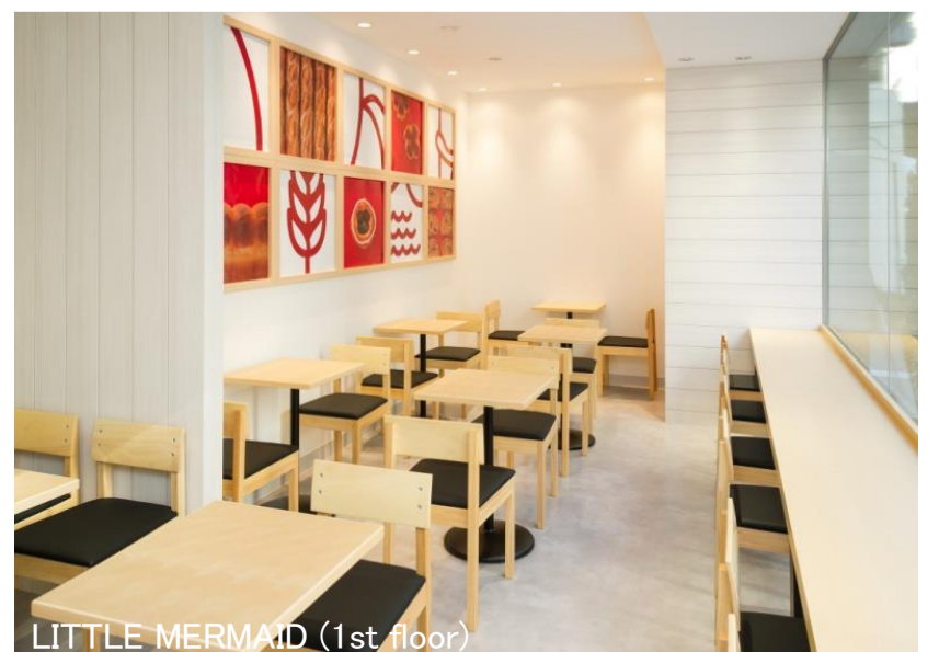
LITTLE MERMAID (1st floor)