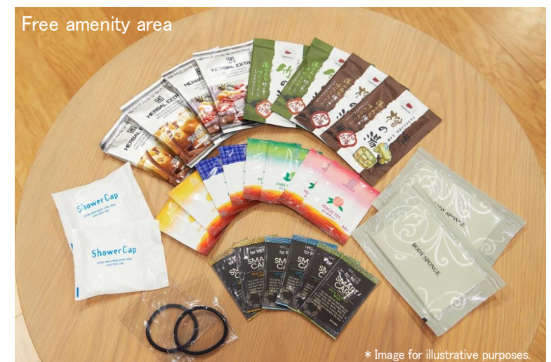
Free amenity area