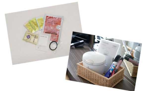
Women's amenity kit * Image for illustrative purposes.

* Women's amenity kit is offered at the lobby. * Mobile charger is lent at the front desk.