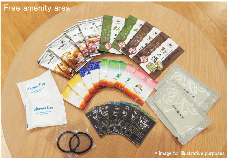
Free amenity area