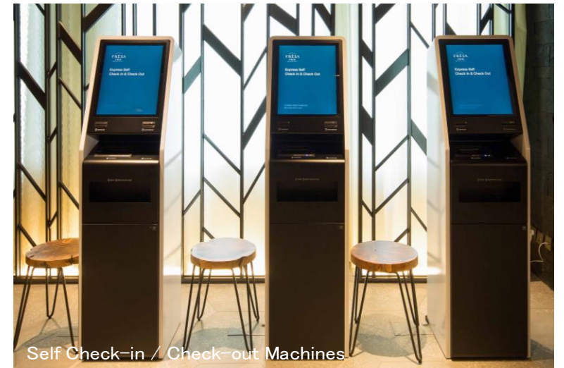
Self Check-in / Check-out Machines