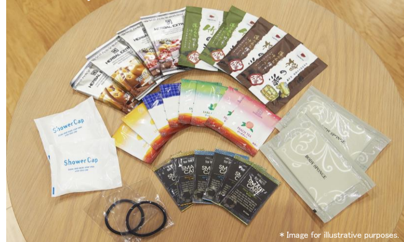
Free amenity area