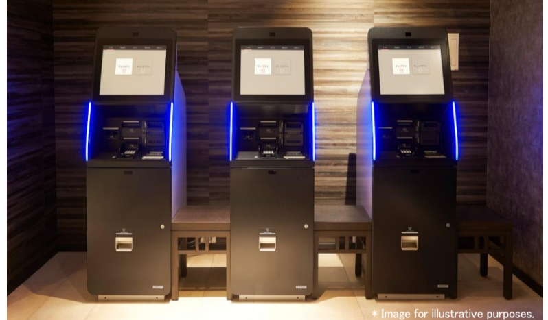
Self Check-in / Check-out Machines