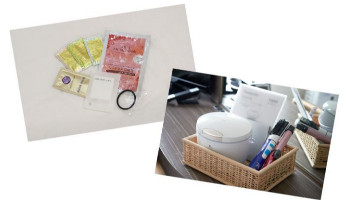
Women's amenity kit