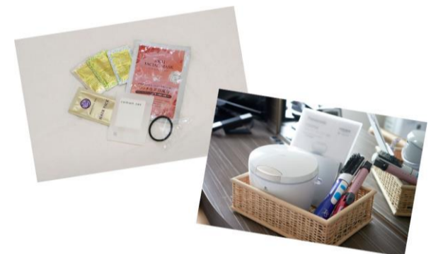
Women's amenity kit