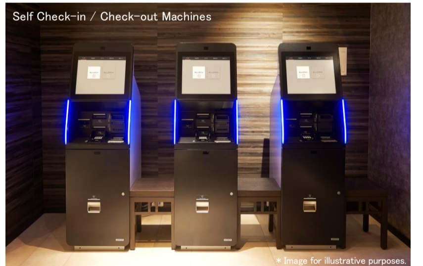
Self Check-in / Check-out Machines