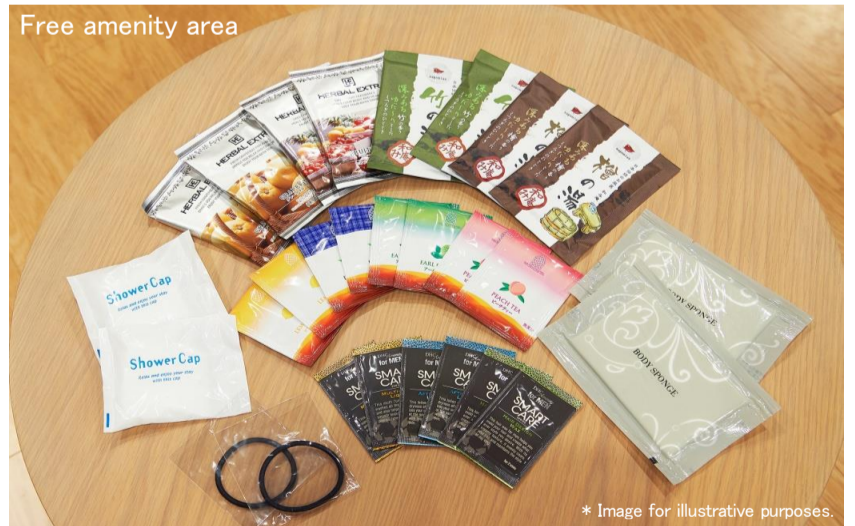
Free amenity area