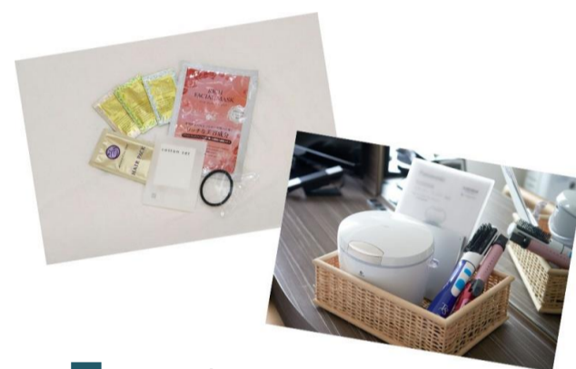
Women's amenity kit