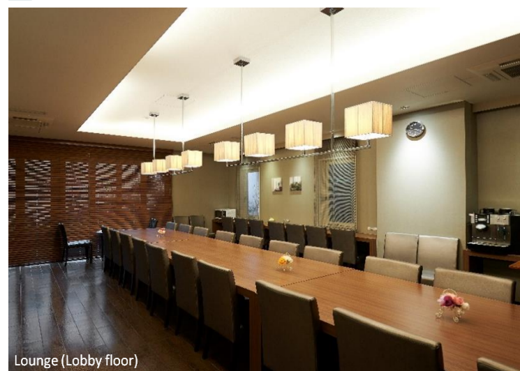
Lounge (Lobby floor)