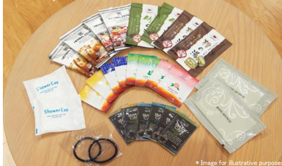
Free amenity area