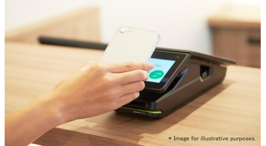
Self Check-in / Check-out Machines