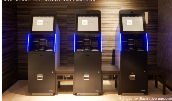
Self Check-in / Check-out Machines