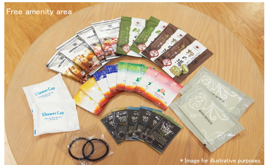
Free amenity area