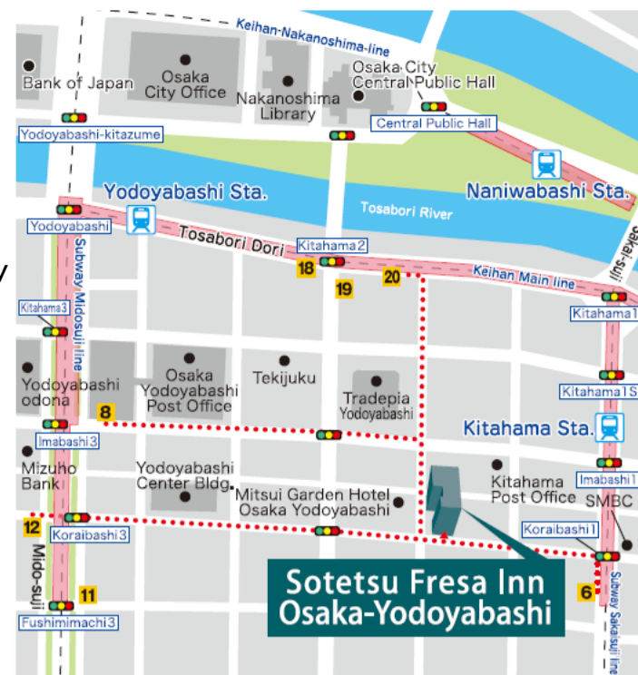
Sotetsu Fresa Inn Osaka-Yodoyabashi

ACCESS : A 5 minute walk from Exit 12 in Osaka Municipal Subway Midosuji Line, Keihan Main Line Yodoyabashi station A 4 minute walk from Exit 20 in Osaka Municipal Subway Midosuji Line, Keihan Main Line Yodoyabashi station A 2 minute walk from Exit 6 in Osaka Municipal Subway Sakaisuji Line, Keihan Main Line Kitahama station