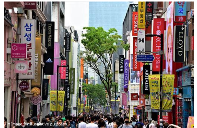
Cashless payments only (no cash)